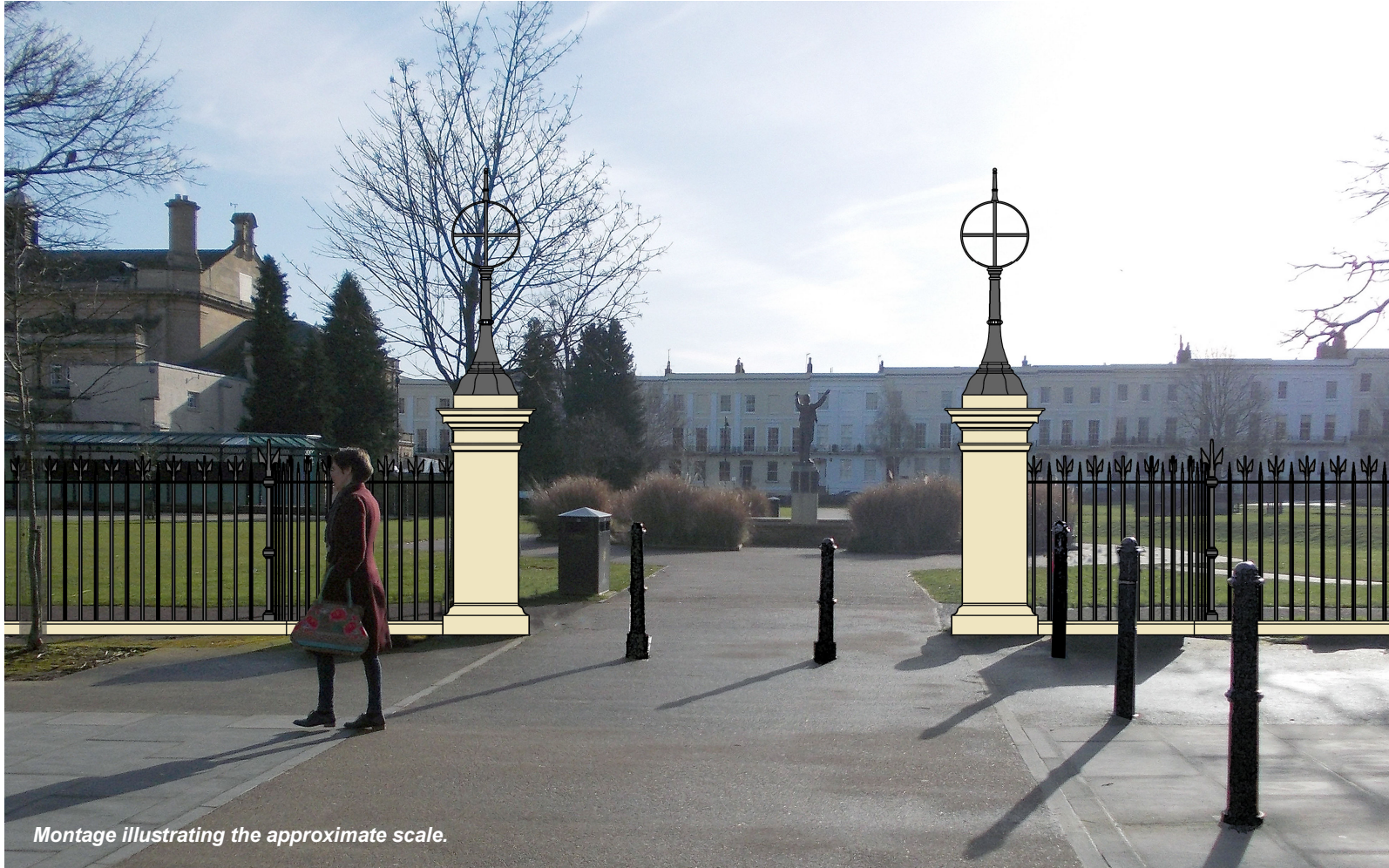
Montage illustrating the approximate scale.